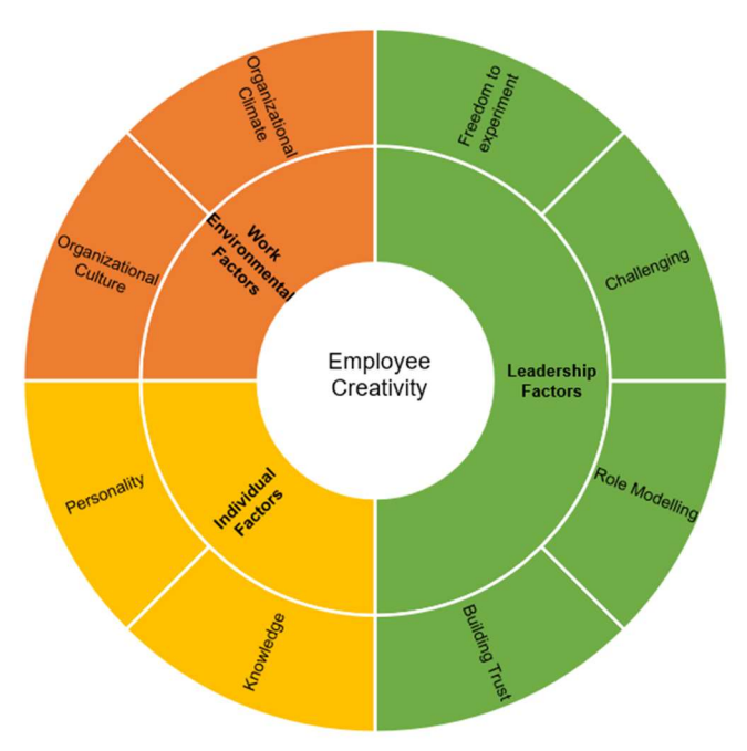
Figure 1. Themes and sub-themes of the Research