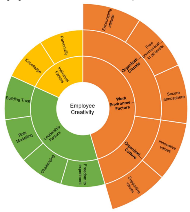
Figure 3. Work Environmental Factors

this research is organizational culture . It represents shared beliefs, assumptions, values, and collective norms in the organization (Locke and Kirkpatrick, 1995). Adoption of supportive and innovative values can inspire employees to be more creative (Brand, 1998). Organizational supporting for new ideas and encouraging innovation can boost creativity.