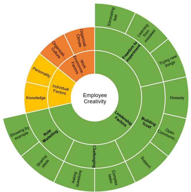
Figure 4. Leadership Factors

factors have been collected into four main sub-themes: giving freedom to experiment, building trust, challenging, and role modelling. These sub-themes are presented with all the characteristics that had been associated with each of them (Figure 4).