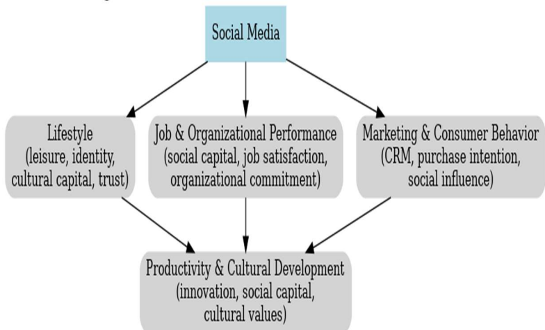
Figure 1. Social median management directions in business activity framework

This conceptual model illustrates the relationship between social media and business activity (see Figure 1). It highlights four main domains where social media has significant impacts: Lifestyle, Job & Organizational Performance, Marketing & Consumer Behavior, and Productivity & Cultural Development. These domains are interconnected and together shape the overall societal outcomes of social media usage.